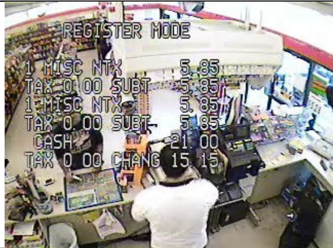
With Text Insertion you see the whole sale!