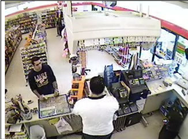
Video without Text Insertion