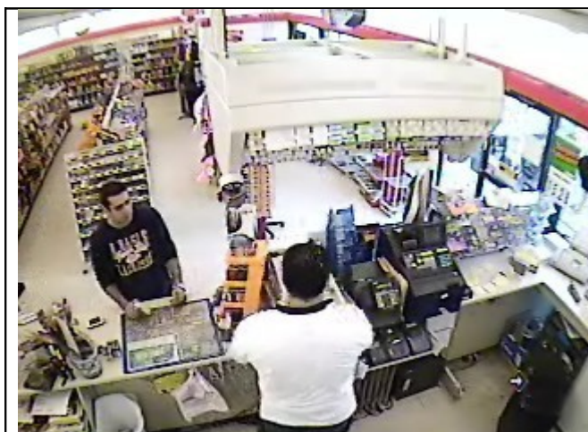
Video without Text Insertion