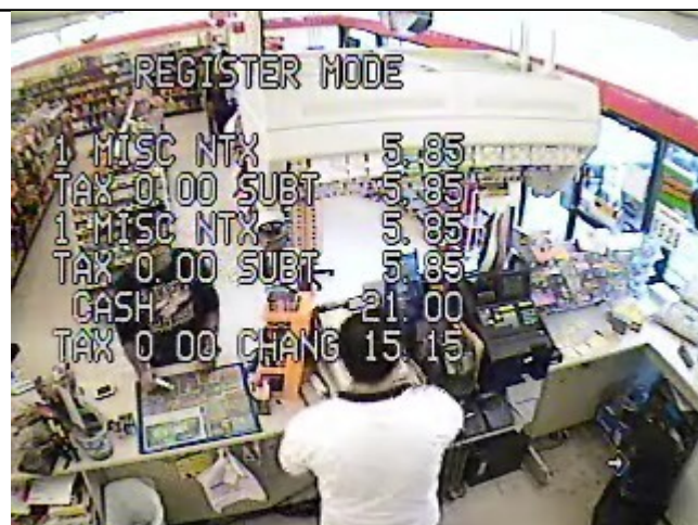
Video with VR2004 Text Insertion