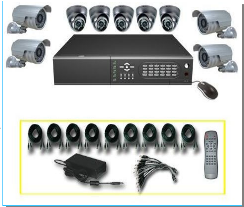
Pictured: Kit KT_3G_9CH