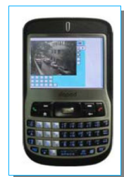
3G image on phone